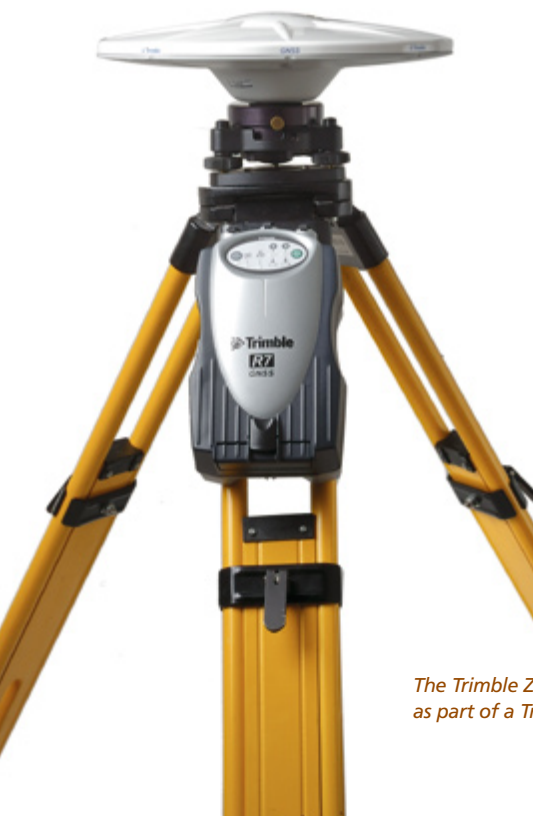
The Trimble Zephyr Geodetic 2 antenna is shown as part of a Trimble R7 GNSS base station.

The Trimble Zephyr 2 and Zephyr Geodetic 2 antennas offer full support for coming and near-future GNSS signals, including GPS L2C and L5, GLONASS, and even Galileo. This technology future-proofing, in combination with the rugged durability of each antenna, means any investment in a Trimble Zephyr GNSS antenna will last for many years.